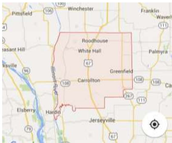
Illustration 1. Thomas H. Boyd Memorial Hospital Service Area; Greene County, IL

Major medical centers in Springfield, Illinois; St. Louis, Missouri; and other locations also receive patients from this hospital service area.